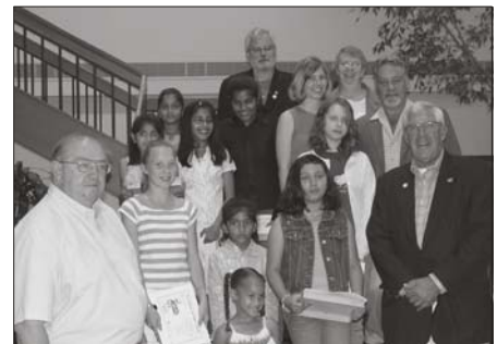
Above: grand prize winners and runners up pose with members of the Village Board at 2006 award's night.

Contest rules and prizes can be downloaded from www.hoffmanestates.org . Contest deadline is May 5, so hurry to enter!