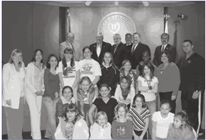
The Hoffman Estates Village Board honored the HEAA Jr. Pee Wee Cheer Team (pictured above) - AYF National Champions at the Village Board Meeting held on February 6, 2006.