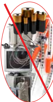
No Batteries, Electronics, or Sharps