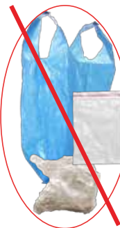
No Plastic Bags or Wrap