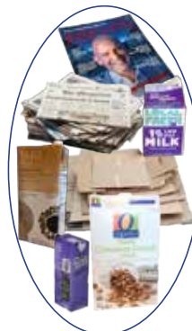
Mixed Paper & Cartons Flatten Boxes