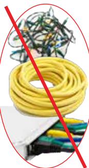
No Hoses, Wires, or Hangers