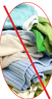
No Clothing or Shoes