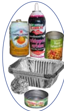
Metal Steel & Aluminum Depressurize Aerosols