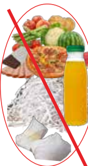
No Food, Liquids, Diapers, or Shredded Paper