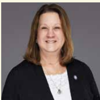
By Bev Romanoff Hoffman Estates Village Clerk