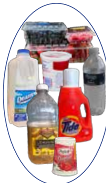
Plastic Bottles - Caps On Preferred, Tubs, Jugs, Jars No Bags, Film, or Foam